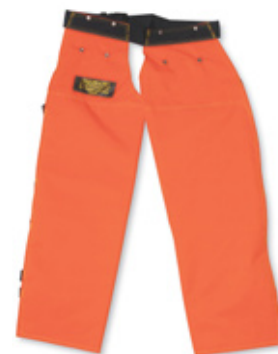
BK70141-FR and BNQ