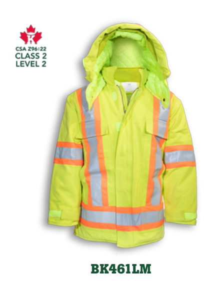
Also Available In: