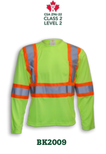
Also Available In: